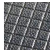
rhombic profile with top coat